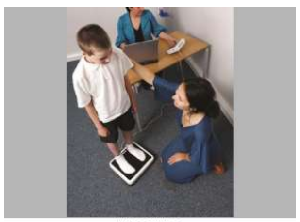
NCMP January/February 2019

With the National Child Measurement Programme (NCMP) running in January and February 2019, the parents section of Health for Kids has lots of information that you can signpost parents too. This will also be shared through our social media channels.